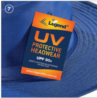
UV protection information label attached

No slouching in this hat – smart, tough and meets all Australian standards for sun protection. Available in 53cm, 55cm, 57cm, 59cm and 61cm sizes.