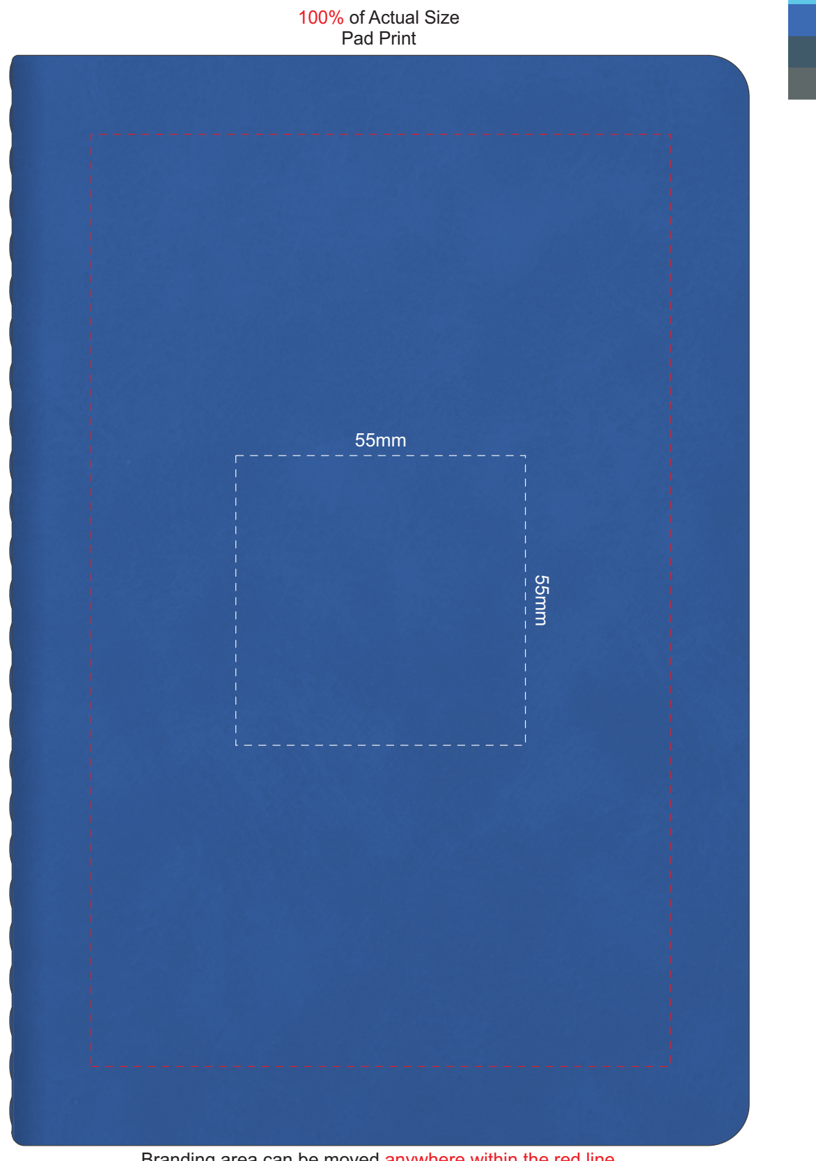
Branding area can be moved anywhere within the red line.